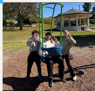
Catty Park Trip